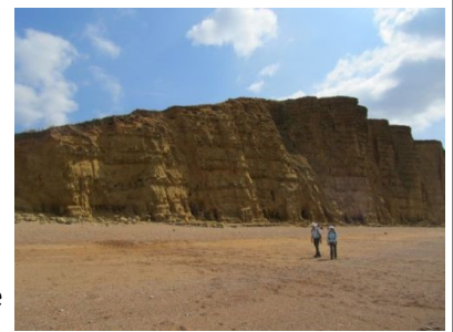
Beach and cliffs at West Bay

At West Bay, the shingle beach is backed by the impressive sheer wall of East Cliff. Here, horizontal beds of golden Bridport sands alternate with nodules of more resistant calcareous sandstone, which jut out giving the cliffs a serrated appearance. There are some interesting rock armour sea defences to look at before continuing along the coast path to pass Eype Mouth.