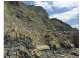
Unstable mud cliffs at Cain's Folly, Charmouth