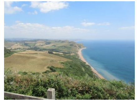
View along Dorset coast from Golden Cap

Bridport and West Bay are served by a regular Wessex bus service (number X51). This service is also known as the 'Jurassic Coaster'.