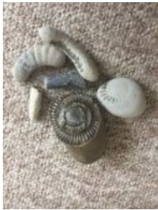
Fossils found at Charmouth

community before the Black Death took its toll – the path heads on towards Charmouth. Part of the coast path here has now been diverted inland over Stonebarrow Hill to avoid some recent cliff collapse.